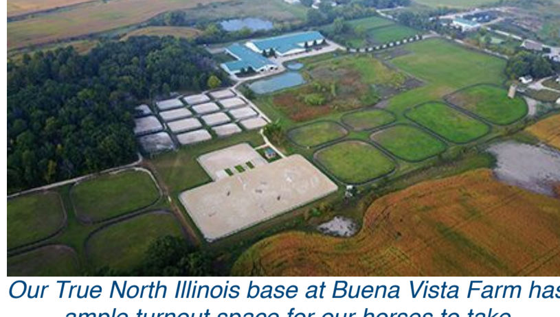
Our True North Illinois base at Buena Vista Farm has ample turnout space for our horses to take advantage of while at home!

We take the time to go through absolutely everything to ensure that all tack and equipment is in good repair and to do a thorough cleaning. We take stock of what we have and of anything that may need to be replaced or purchased. Two of our 'spring cleaning' suggestions include: