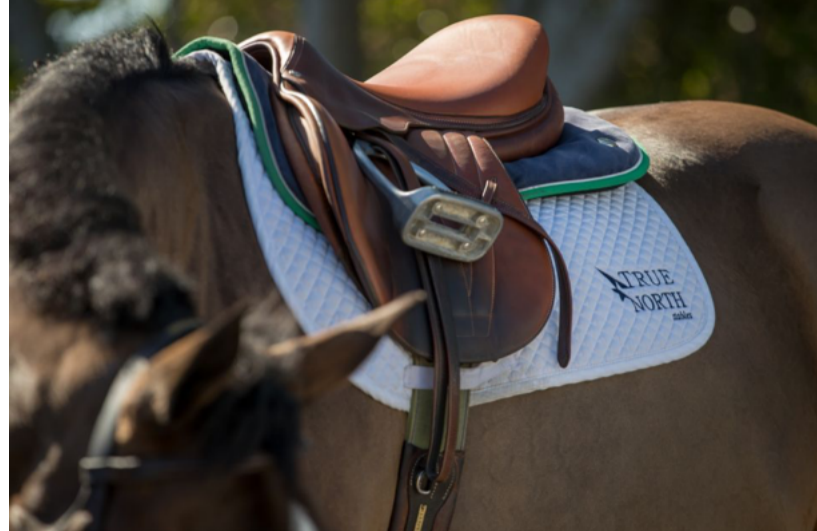
While at home, we do a thorough inventory and cleaning of all of our tack and equipment (including our favorite Butet saddles)!

Once we get home in April, we take spring cleaning seriously!